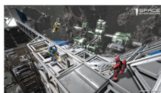
Fig. 1. A game called Space Engineers as an example of an XR system, featuring advanced 3D worlds and an elaborate system to construct sophisticated custom objects, from simple solar panels to a complete space station.

Index Terms —agent-based testing, AI-based testing, testing computer game, testing virtual reality, user experience testing